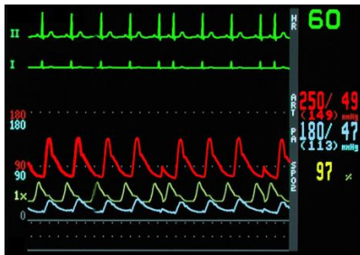
SINGLE BED DISPLAY